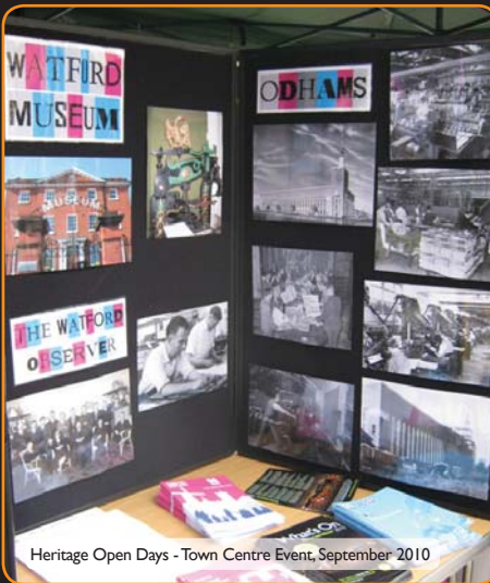
Heritage Open Days - Town Centre Event, September 2010

29 & 30 October The Haunted Museum Spooky family fun. 6.30pm (age 6+) and 8pm (age 10+). £6 per session. For information on the above tel: 01923 232297 or email: info@watfordmuseum.org.uk . Visit: www.watfordmuseum.org.uk